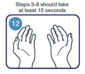
Your hands are now safe